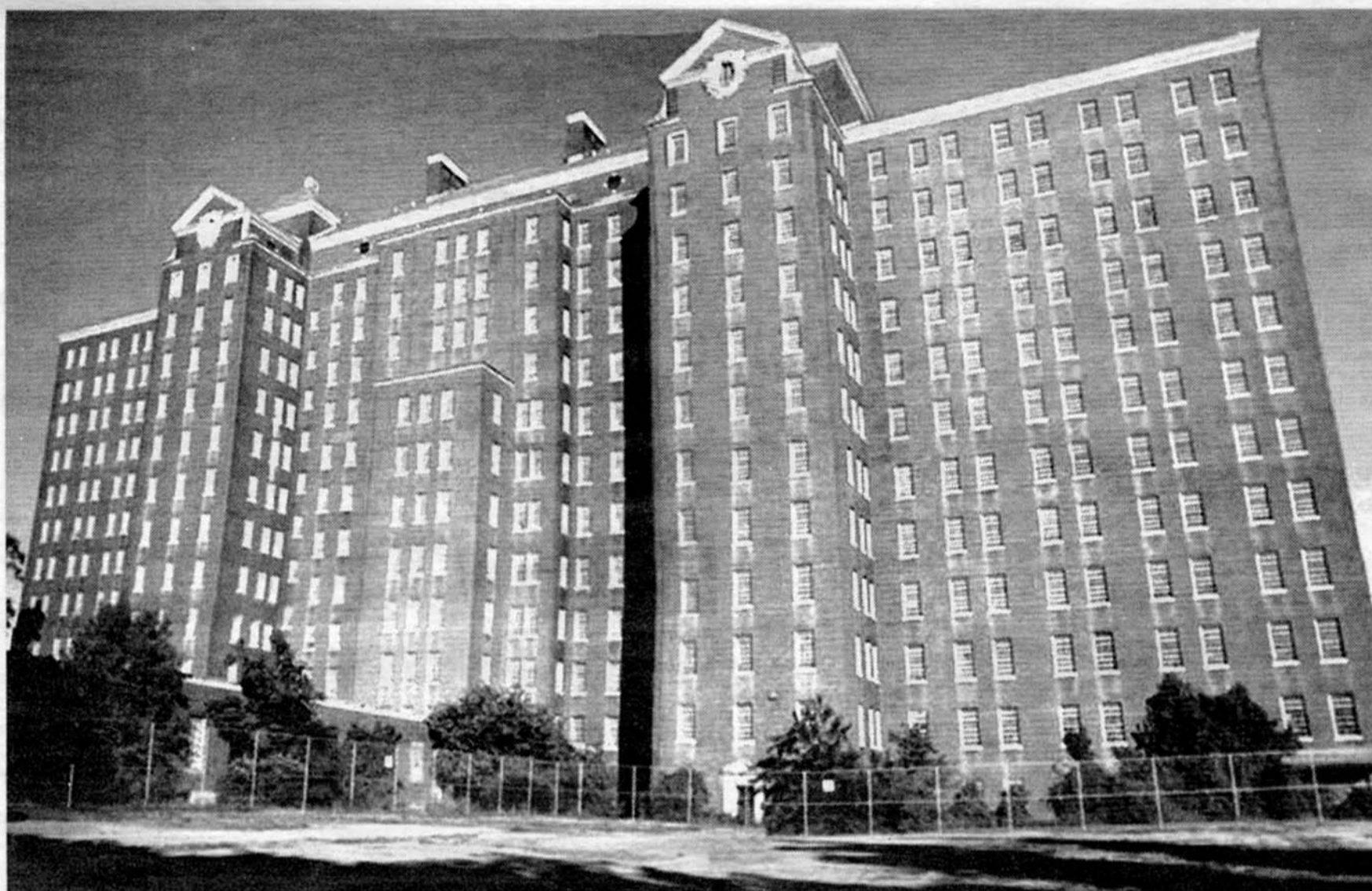
Kings Park is still an ominous and alluring destination for curiosity seekers.